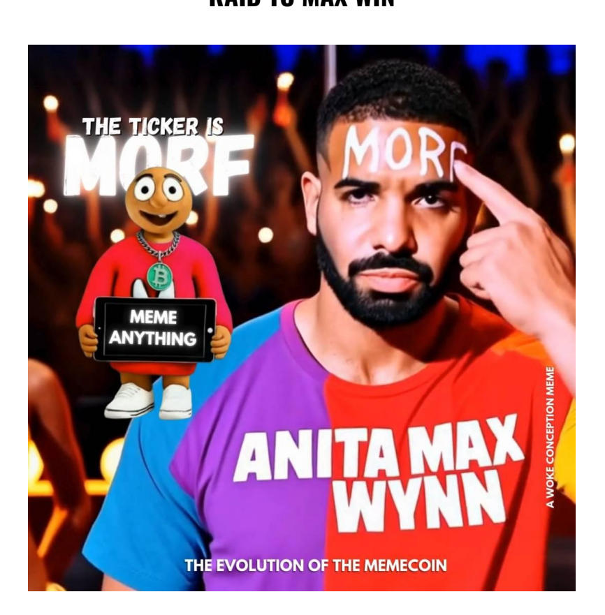
RAID TO MAX WIN

MORF utilizes Al-driven technology to scan for trends, news, and viral moments across the internet. When a new event or meme emerges, MORF instantly adapts, creating relevant and timely content that can capture the cultural moment. This adaptability is what differentiates MORF from other meme coins and ensures that it can continuously stay relevant.